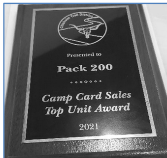
2021 Top Unit Award for Camp Card Sales